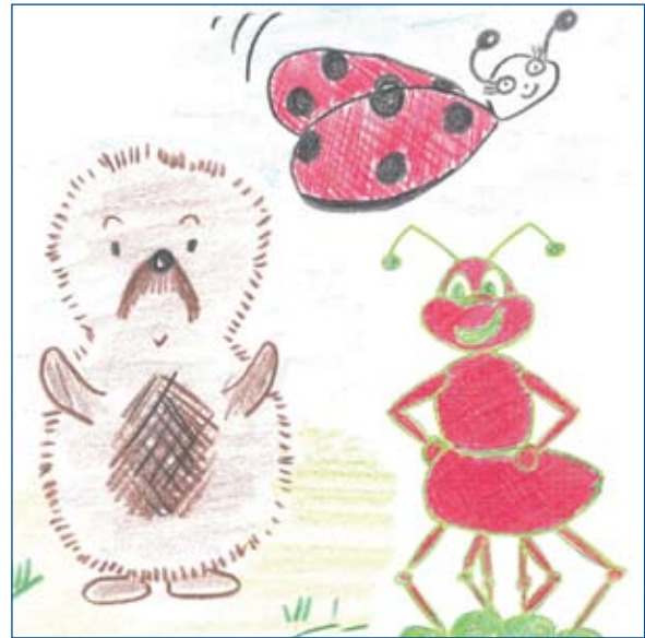
Trail characters Henry the Hedgehog, Lottie the Ladybird and Art the Amazing Ant

Look out for our trail characters events, and our Scarecrow event, all of which will encourage children to explore and enjoy the outdoor environment.