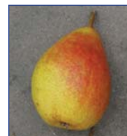
Plot 22: Louise Bonne de Jersey