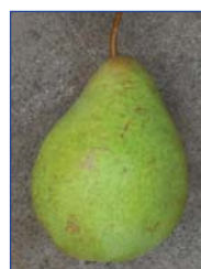
Plot 25: Beurre de Jongue