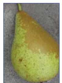
Plots 18,19,25: Conference