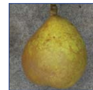
Plot 24: Bussoch