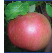
Newton Wonder Red

Apple Day in October is the highlight of the fruit season and a time to taste and buy some of the more unusual varieties.