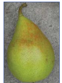
Plot 19: Unknown