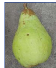
Plot 22: Pitmaston Duchess