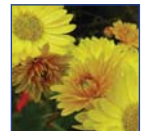
Chrysanthemum 'Cottage Lemon'