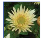
Chrysanthemum 'Wedding Day'

The last burst of colour comes with the salmon Schizostylis and pink Nerines, some hardy, and others which need the shelter of the glasshouse.