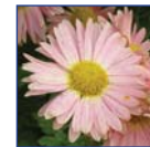
Chrysanthemum 'Perry's Peach'

Cottage chrysanthemums, like dahlias, are coming back in fashion and Hill Close Gardens is an excellent place to see them in their glory as there are more than twenty different cultivars in the gardens. You will find 'Perry's Peach', 'Cottage lemon', 'Wedding Day' as well as 'Mrs Jessie Cooper No1' which is reputed to have been handed over the fence in many gardens in Badsey.