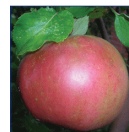
Newton Wonder Red

fruiting well after being brought back to fruit bearing after years of neglect. August saw the 'Beauty of Bath' and the 'King of the Pippens' and many of the 63 different varieties in the Gardens ripening in September. The russet 'Golden Knob' is one of the last to be gathered and needs to be kept for a few weeks before it is ready to eat.