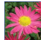
Chrysanthemum 'Mrs Jessie Cooper No1'